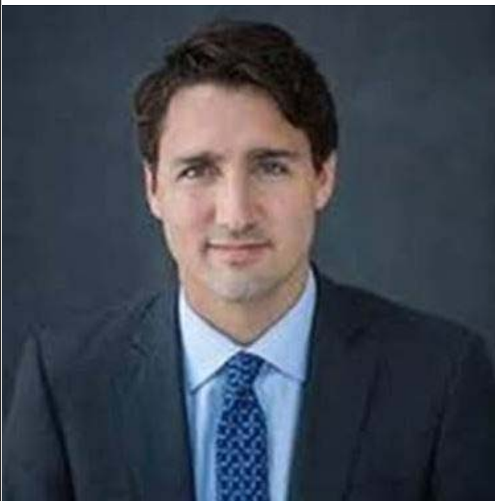
Left-Winged Ding Bat