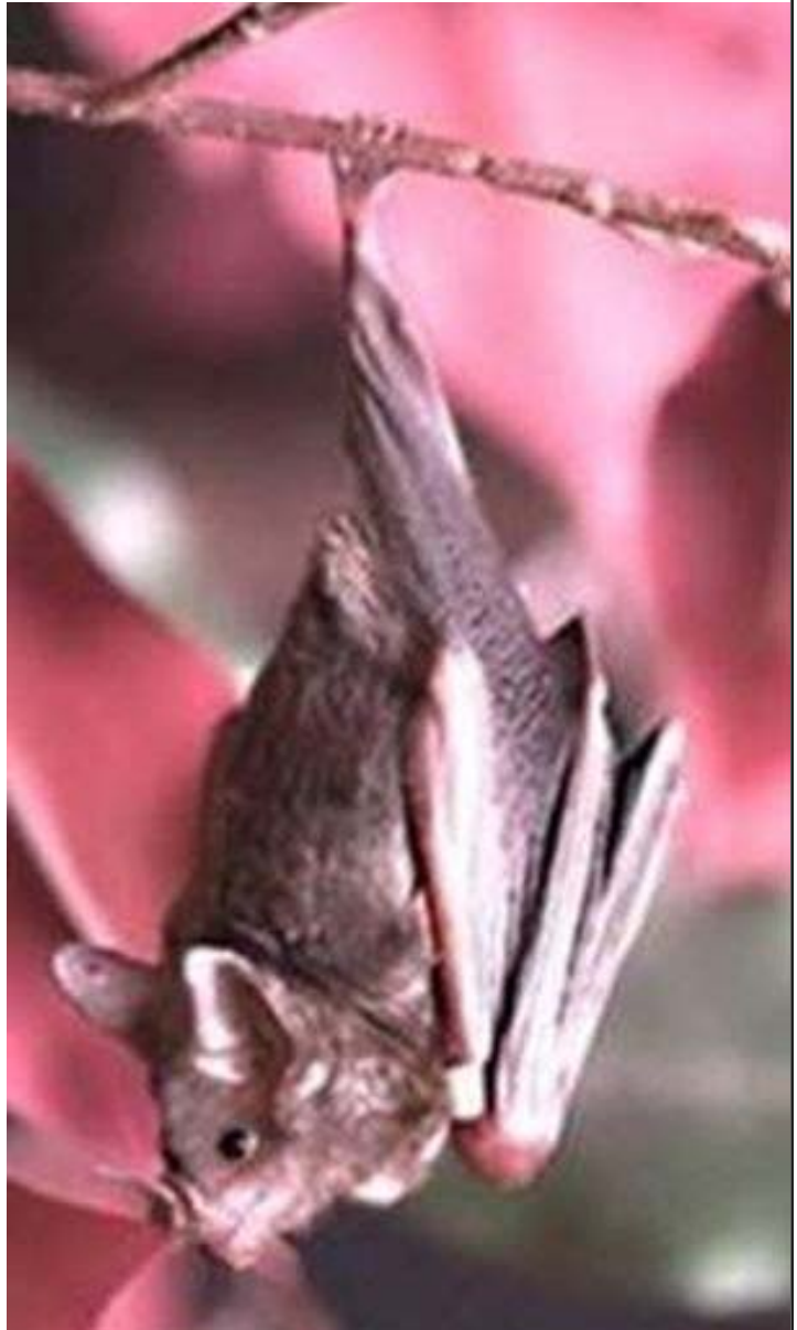
Red-Winged Fruit Bat